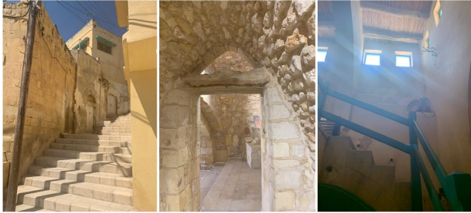
Figure 2. Interior features of Qaqish House